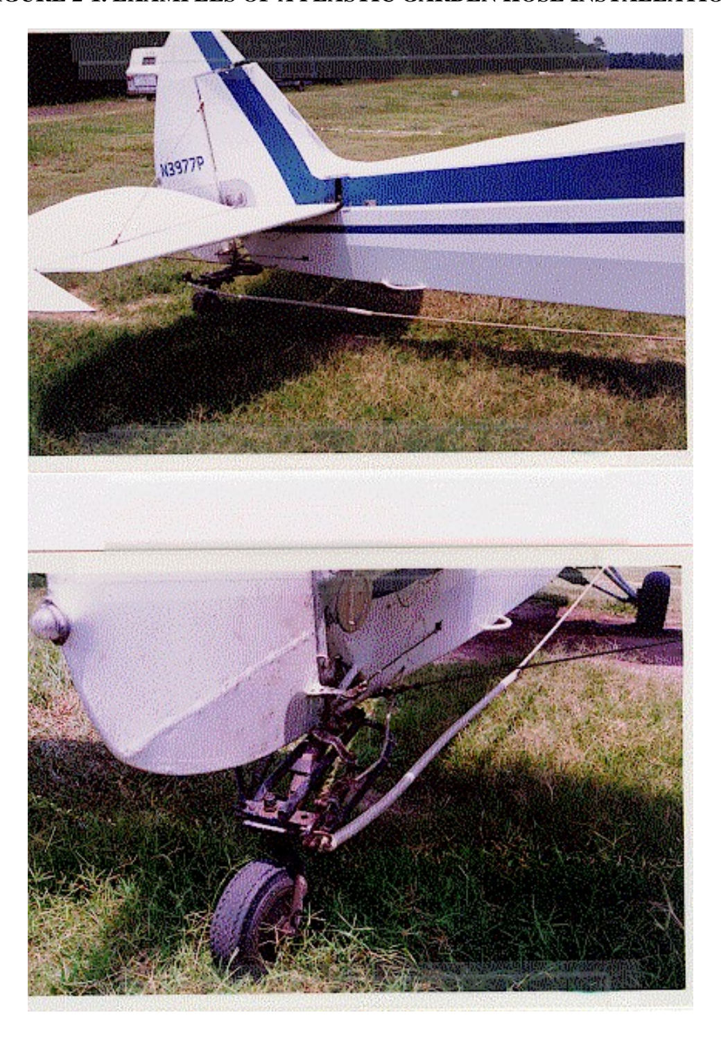
FIGURE 2-1. EXAMPLES OF A PLASTIC GARDEN HOSE INSTALLATION